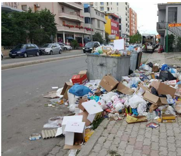
Photo of waste containers in the city of Durrës, June 2020