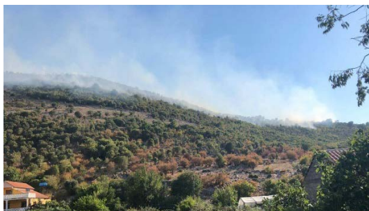
Photo from the fire hearth in the area of Lezha.